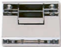
Cat. No. GTC037 SQUARE CORNERS