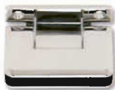
Cat. No. PTC037 BEVELED EDGES